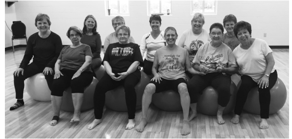
(Photo taken pre-COVID)

The PCWC continues to add some new equipment (treadmills, Sci-Fit, new aerobic steps, lifting bars) for all the different needs of our members. It is our goal to upgrade or add equipment annually to keep things in great condition. We have some equipment that is not normally found at a local gym that can aid in rehabilitation from injuries or surgeries as well as machines that assist you with getting started on your wellness journey. We also have sophisticated expert-level equipment for high level training.